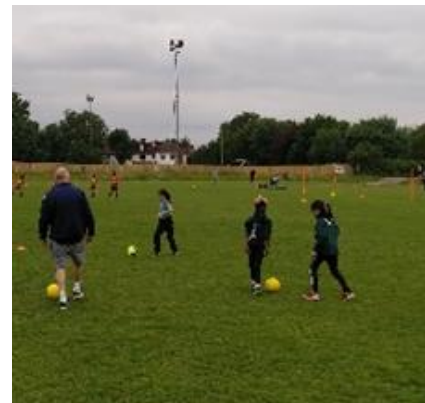
Football training session