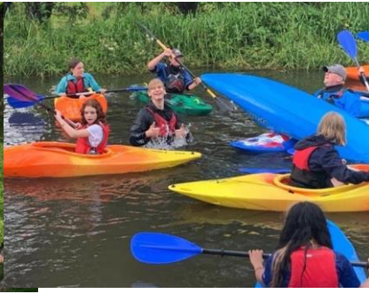
Kayaking on the River Wey