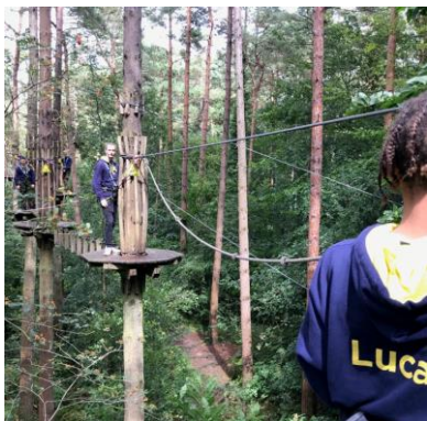
Explorers at Go Ape

The Explorers hiked to, and went swimming in, Frensham Great Pond and visited the Spectrum as well as Go Ape just a few miles away.