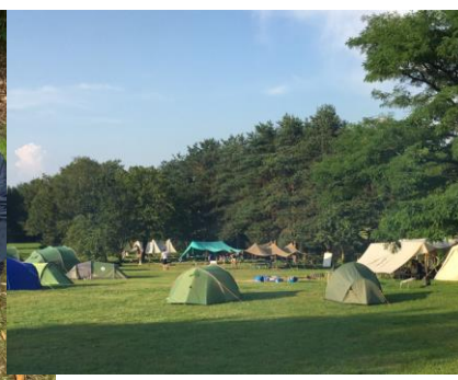
Summer camp site