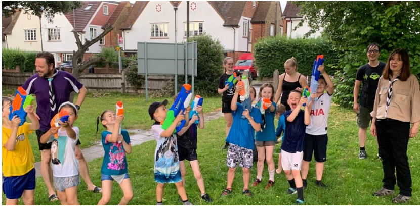
Water lot of fun!