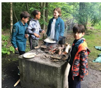
Skills camp: Patrol cooking and eating freshly grown spaghetti

Despite often very heavy showers, spirits were high. The Scouts cooked all their breakfasts and dinners on fires, and were able to canoe and kayak on the River Wey, build rafts, participate in shooting and archery, go on hikes and visit the Spectrum leisure pool in Guildford.