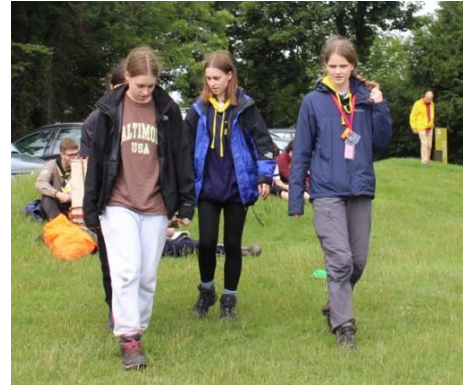
SSESU Day Flare teams

Due to Covid restrictions, the Annual District Sports Day had to be cancelled for the second year running as was the Cubs District Football Competition. Nevertheless, the Cubs made up for it with a variety of sporting related activities. Members of the Raynes Park Vale FC come along and give them a training session. The pack may not have got to a final, like England, but they all had a lot of fun. They also had a go at the Athletics badge and ran a frisbee golf championship and finished the term with a session of bowls with Merton Bowling Club. The Beavers too had great fun frolicking around in the sun. They put up tents, played games, ran and jumped in an athletics competition, learnt about using compasses for navigation, had a water fight, and learnt first aid. Indeed, all the Beavers went home and put their parents into the recovery position!