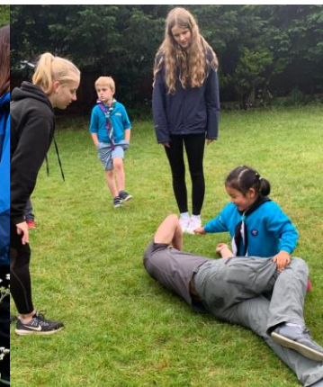
The recovery position