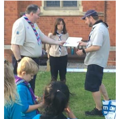
Owl gets award