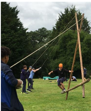
Walking the A-Frame