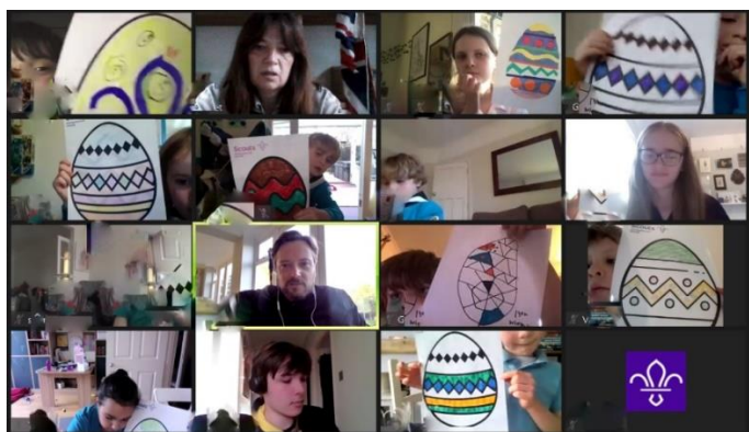
Decorating Easter eggs, its no yoke!