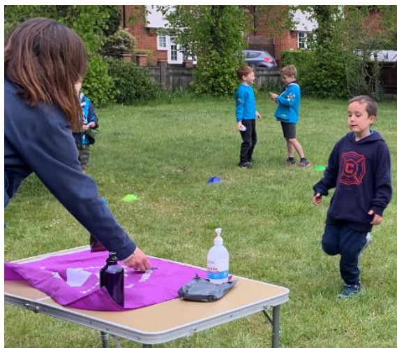
Receiving Challenge Award badges

A strong theme of this term will be having adventures and keeping fit. So far, the Beavers have made compasses by magnetising nails and learnt basic compass skills. Over the coming weeks they will be exploring Cannon Hill Common, having a sports evening, learning about health and fitness and enjoying an array of fun games. They are also planning to take part in a District Beaver 35 Year Anniversary Party at Walton Firs in June and having a virtual sleep over.