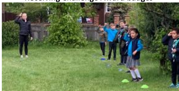
Doing what Simple Simon says