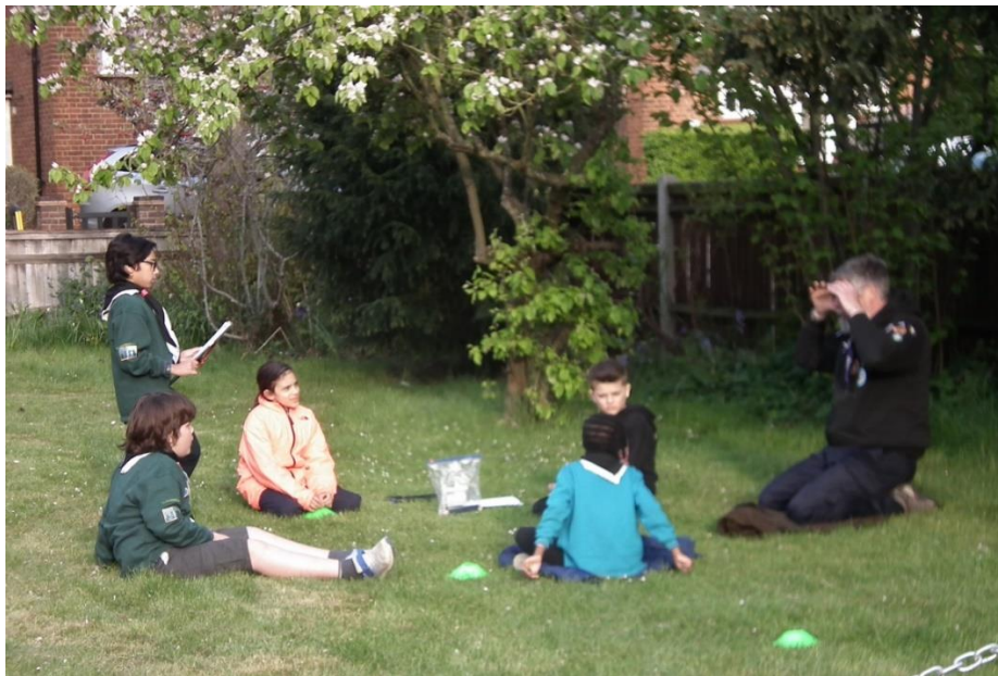
Cubs receiving instruction from Chil.

Cubs launched their outdoor meetings by learning some basic scouting skills – lashing spars together so they can be the engineers of the future and reviewing their navigation skills on Prince George's Playing Fields. Some will shortly be participating in the District Cyclocross event at Frylands Wood.