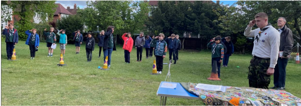
Cubs socially distancing during flag break.

Cubs launched their outdoor meetings by learning some basic scouting skills – lashing spars together so they can be the engineers of the future and reviewing their navigation skills on Prince George's Playing Fields. Some will shortly be participating in the District Cyclocross event at Frylands Wood.