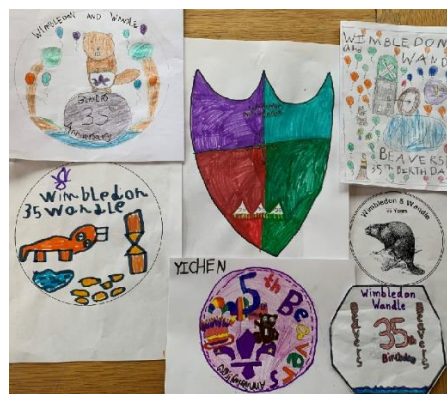
Beaver commemorative badges

A strong theme of this term will be having adventures and keeping fit. So far, the Beavers have made compasses by magnetising nails and learnt basic compass skills. Over the coming weeks they will be exploring Cannon Hill Common, having a sports evening, learning about health and fitness and enjoying an array of fun games. They are also planning to take part in a District Beaver 35 Year Anniversary Party at Walton Firs in June and having a virtual sleep over.