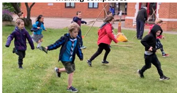
Letting off steam