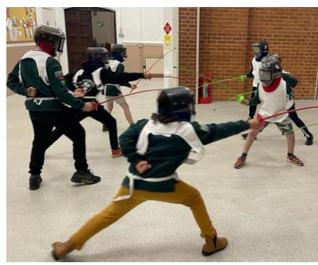
No of-fence meant