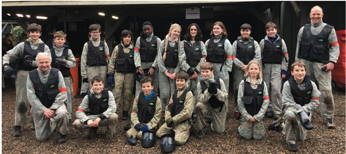
13 th Paintballing Squad

In the County Night Exercise, the troop seized 4 th and 5 th places out of a field of 43 teams from across the county. Margins were tight. Three teams tied for first place with 13 th Wimbledon B team one point behind and the 13 th A team one point behind them.