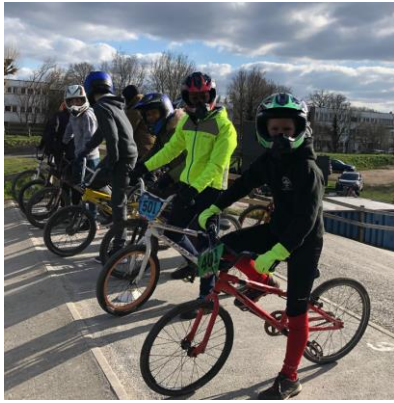
Scouts & dads line up