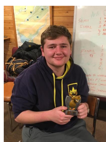
2022 Donkey Champ