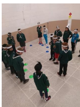
A good knight playing chess