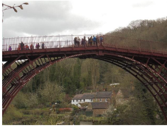
Stop off at Iron Bridge on the way home