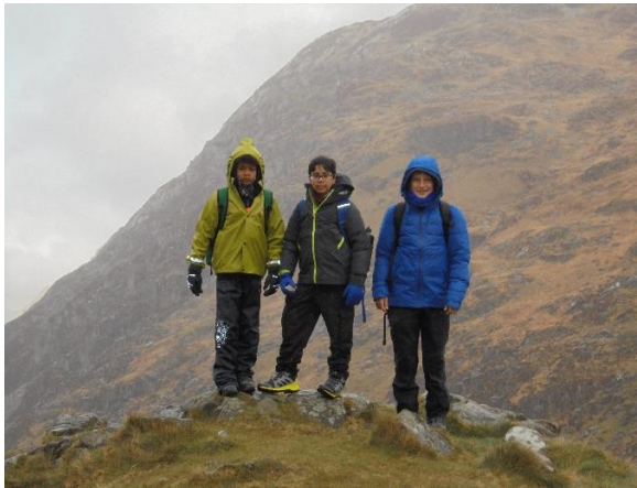
New kids on the block setting out

The 13 th Scouts have been making annual trips to Snowdonia for over 40 years. It was great to be back!