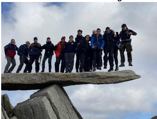
Explorers on the Glyders