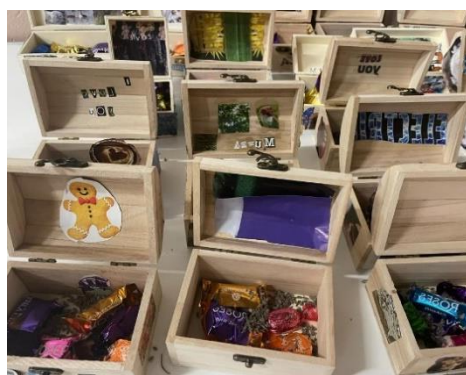
Boxes of treats for Mums' Day