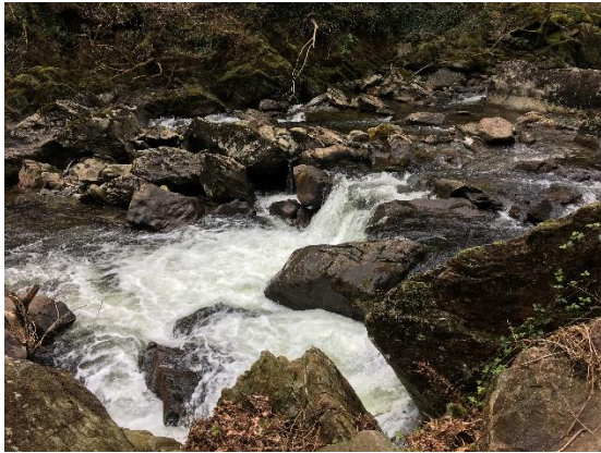
River below Beddgelert