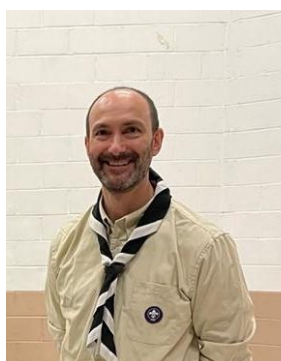
Baloo joins the leadership team

A human chess competition, with each cub playing a different piece, prepared them for the district chess competition while in the run up to Mothering Sunday they made keepsake boxes for their mums. They then rounded off the action-packed term with an evening of fencing, (with swords, not planks!).