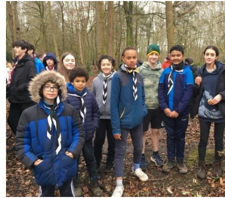
13 th County Night Exercise entrants