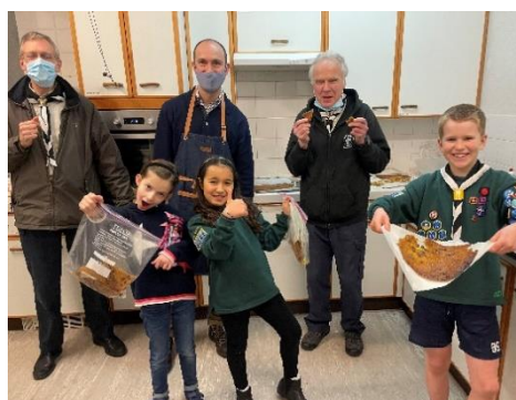
A piece of cake, or is it biscuit?