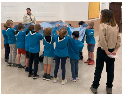
Beavers make waves at a going up to Cubs ceremony