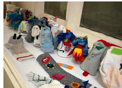
Another socksuccessful evening making glove puppets