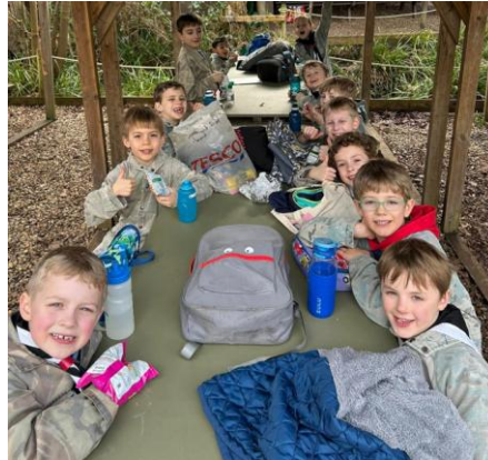
Beavers take a breather from tracking down aliens at the Laser Park