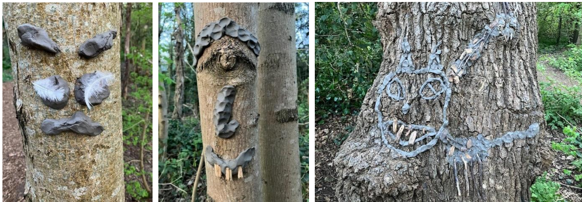
The trees come alive on Cannon Hill Common!

They finished the term in the woods on Cannon Hill Common making the trees come alive with some simple cosmetic additions.