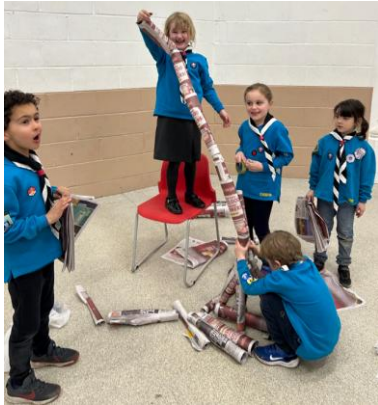
Beaver's prototype to compete with Elon Musk's Space X

Beavers have been busy with a whole array of new experiences