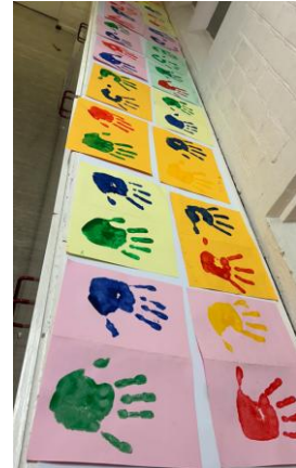
Prints prepared for Mothering Sunday, or maybe Palm Sunday?