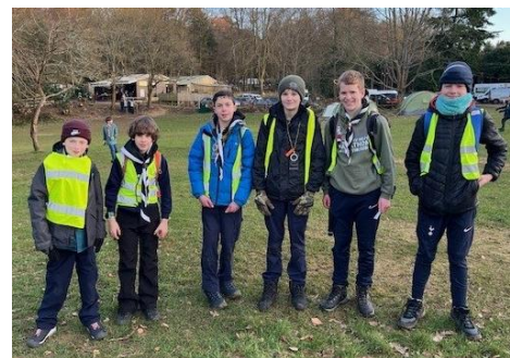
The night hikers

The 5-a-side teams, though, did rather well qualifying for the final rounds but just missing out on a final place.