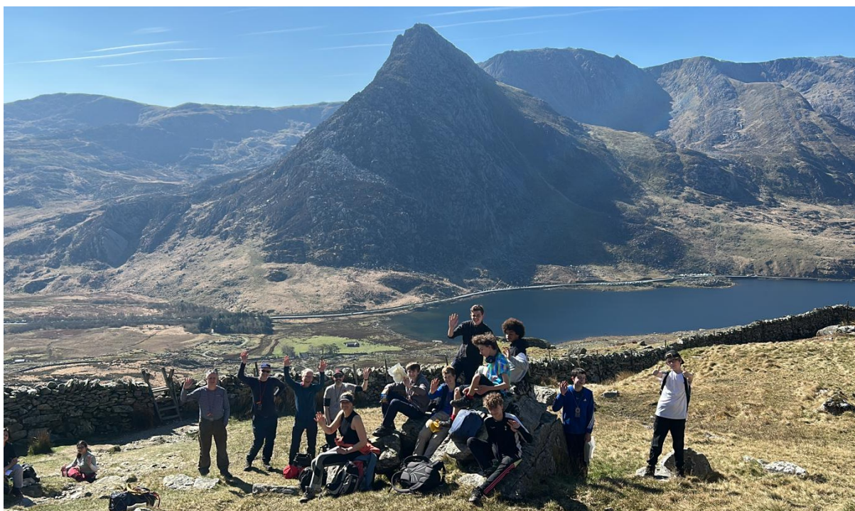
Iconic picture of Tryan from halfway up Carnedd Dafydd