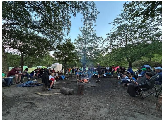
Traditional Camp Fire