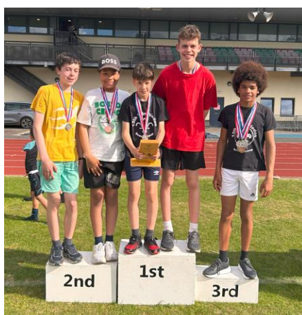
Scouts' winning Tug o' War team