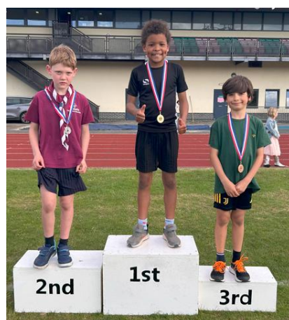
Cubs come first in 100m sprint

The Beavers also had fun with their own sports event in the afternoon. Following a range of novelty events, their highlight was to venture onto the running track for a 100m sprint; for most, probably their first time ever.