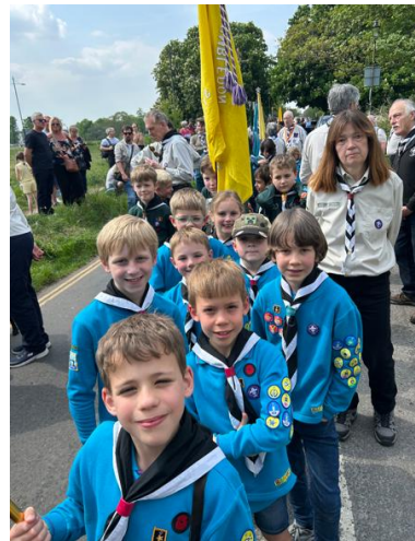
Beavers line up with the rest of the Group for St George's day parade