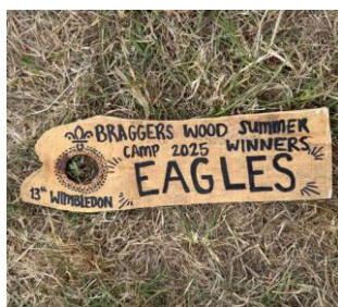
Camp patrol trophy

Twenty Scouts attended a four-day summer camp at Bragger's Wood near Bournemouth. They were blessed with fine weather with activities including navigating through the New Forest, a paradrop (volunteers are dropped off at an undisclosed location at night and have to navigate their way back to camp), laser tag, tomahawk throwing, archery, shooting and sea swimming. A competition was held throughout the camp covering morning inspections, a cooking competition and creative challenges. Eagles were the overall winners and were presented with a unique trophy to mark their achievement.