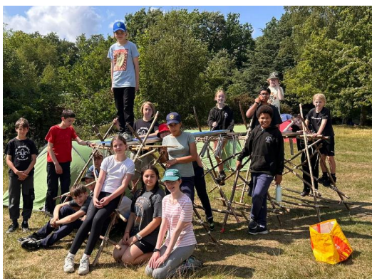
The Scouts' trestle bridge

During the camp the Cubs enjoyed archery, crate stacking, climbing, and backwoods cooking. The Scouts built a trestle bridge out of staves and a buggy out of pine spars and plastic drums.