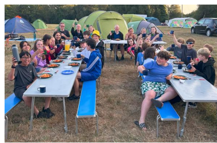
Banquet at the end of camp

Thanks to those parents and past Scouts who came along to help on the camp – without you it would not have been possible. 😊