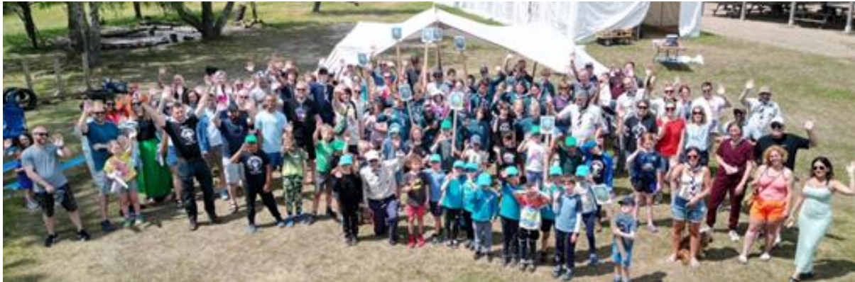
Beavers, Cubs Scouts and Members of the Group Council before the AGM