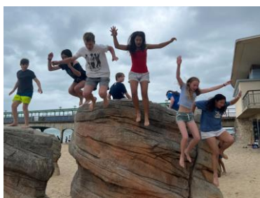
Fun on Bournemouth Beach