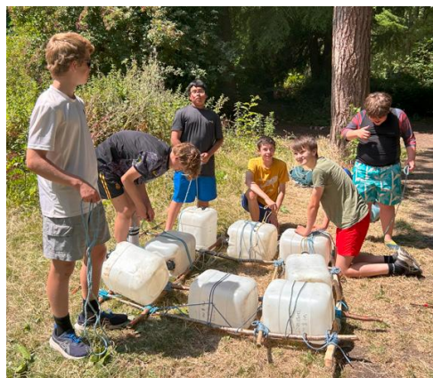
Much still to learn