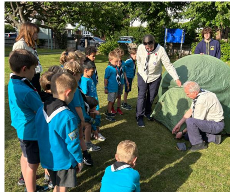
Beavers learn how to pitch a tent

They tackled the My Adventure Challenge Award, and the Health and Fitness and Explore Activity badges. Beavers is the first step on the Scouting adventure where they are introduced to skills and ideas that they will use throughout their Scouting careers and beyond. The summer term featured navigation and camping. They learnt about maps and compasses as well as how to put up and take down a tent, with expert instruction from Skip!