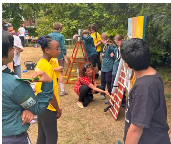
Splattered Rats and Wet Sponges

The Scouts were in action again at the St Saviour's Family Fun Day running the (free) side shows which never fail to attract the young attendees.