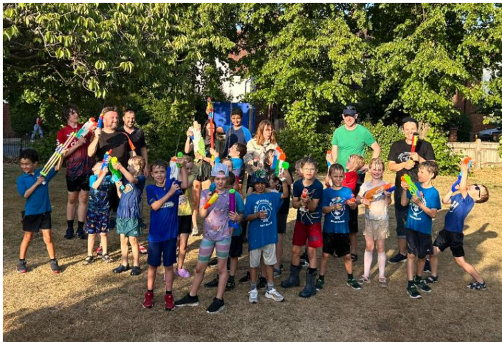
Beavers fully prepared for a water fight

They also ventured onto Cannon Hill Common as much as they could, visited Beverley Brook to sail boats and had the traditional summer water fight which coincided with one of the summer's heatwaves. All in all, a great term!